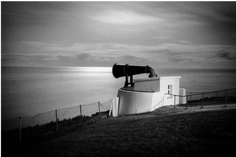
2/ De Finibus Terrae © Alain Willaume