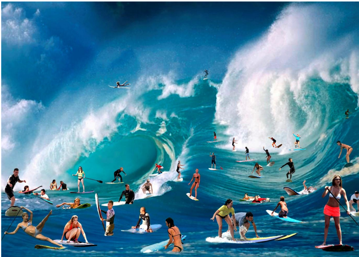
Font du surf, Série Paparazzis, 2012 © Mazaccio & Drowilal

An exhibition of photographs and video Curated by François Hébel