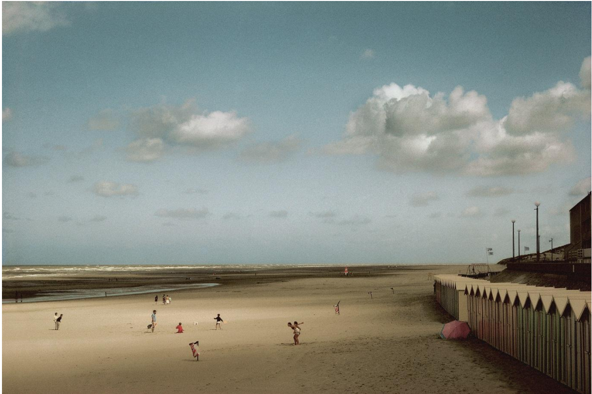
3/ France, Picardie, Baie de Somme, Fort Mahon Plage, 1991